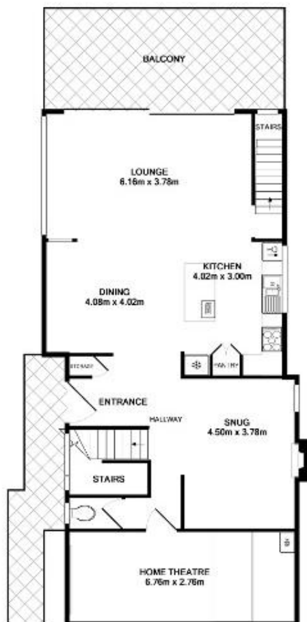
LOWER LEVEL 1