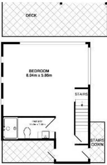
LOWER LEVEL 2