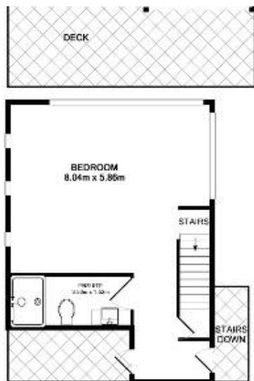
LOWER LEVEL 2