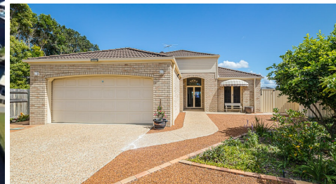
Keyline is for visual purposes only.