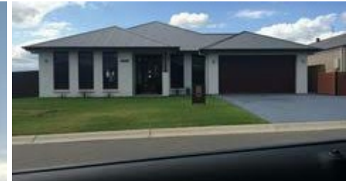
Lot 46 Rory Street, Logan Reserve