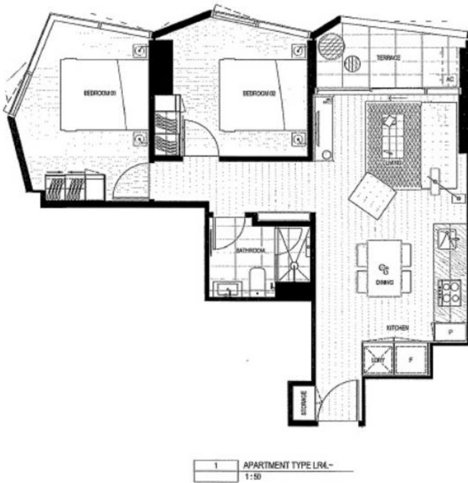
1 APARTMENT TYPE LR4- 1:50