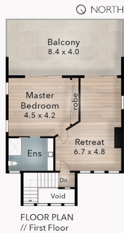
FLOOR PLAN // First Floor