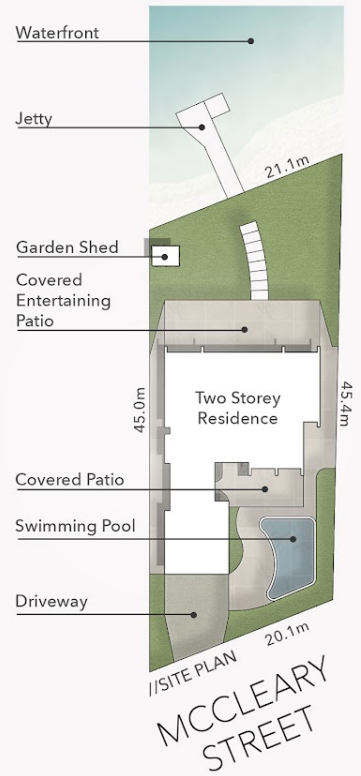
//SITE PLAN MCCLEARY STREET

32 McCleary Street SORRENTO Block Size 851m 2