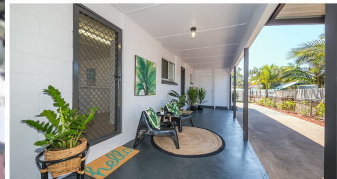
Keyline is for visual purposes only.