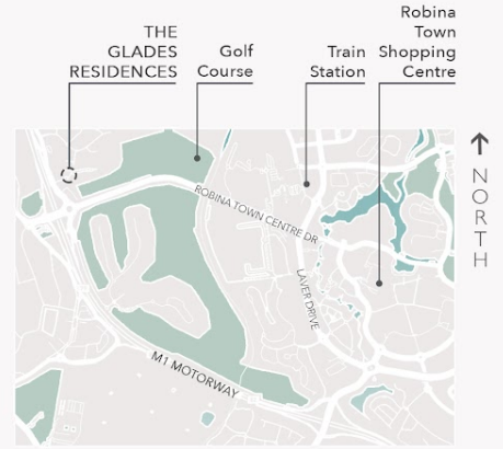
// LOCATION MAP

THE GLADES RESIDENCES 3/501 North Hill Drive ROBINA