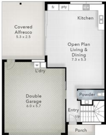
// FLOOR PLAN Ground Floor

Southport | Boutique Townhouse Apartments