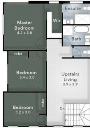
// FLOOR PLAN First Floor