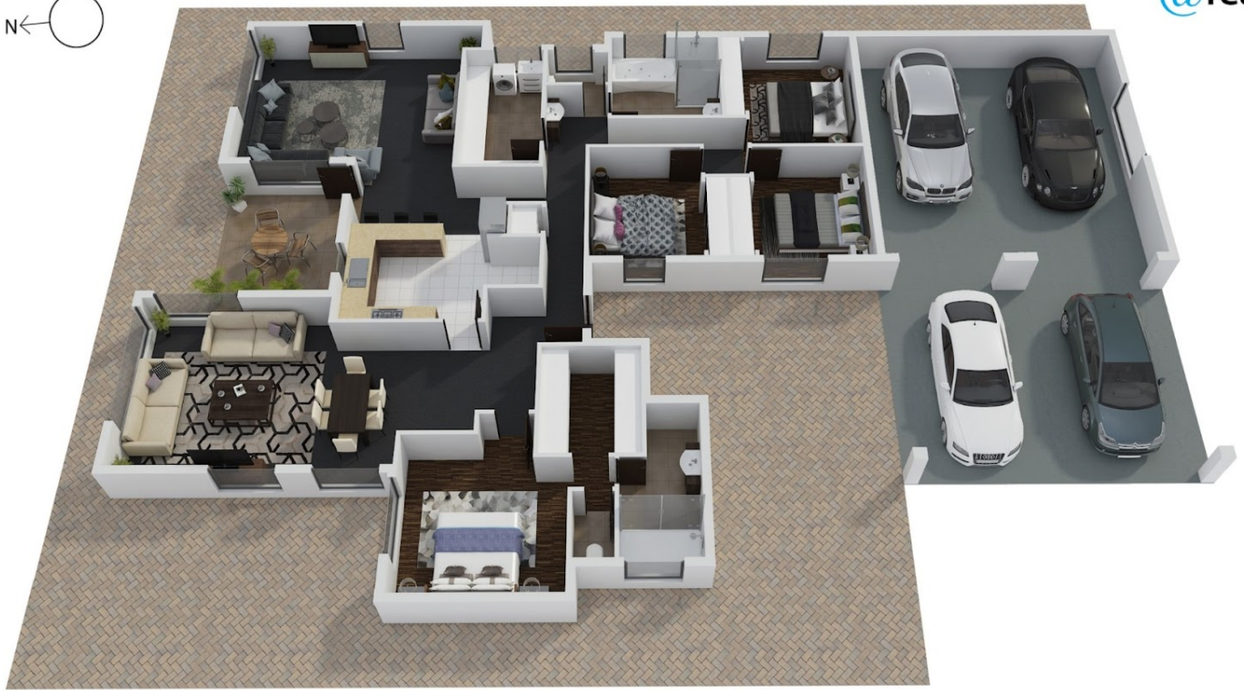
2-4 GLOVER COURT MONTVILLE

Disclaimer: Please note this floor plan is for marketing purposes and is to be used as a guide only. All dimensions are estimates only and may not be exact measurements.