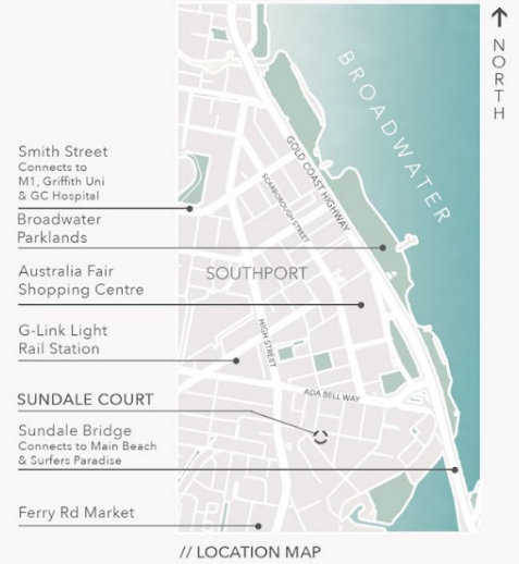
// LOCATION MAP

SUNDIAL COURT 9/34 Meron Street SOUTHPORT