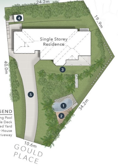
SITE PLAN LEGEND 1. Swimming Pool 2. Poolside Deck 3. Terraced Yard 4. Cubby House 5. Driveway

5 Gould Place PACIFIC PINES Block Size 1,032m 2