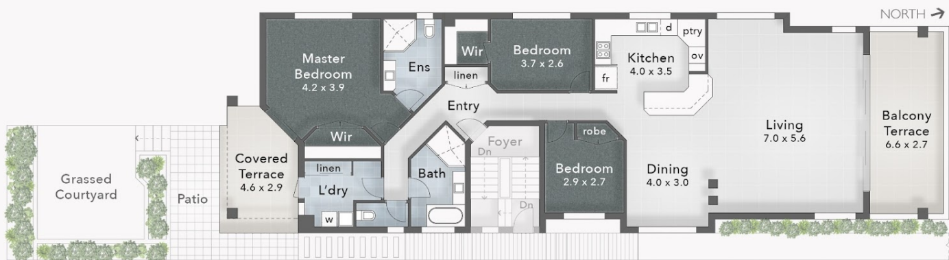
// FLOOR PLAN First Floor - 2.5m Ceiling