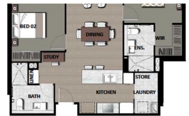
TYPE 1 + 1R