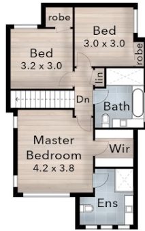
// FLOOR PLAN First Floor