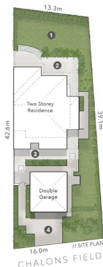
// SITE PLAN

5111 Chalons Field ROYAL PINES Block Size 591m²