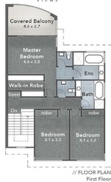
// FLOOR PLAN First Floor