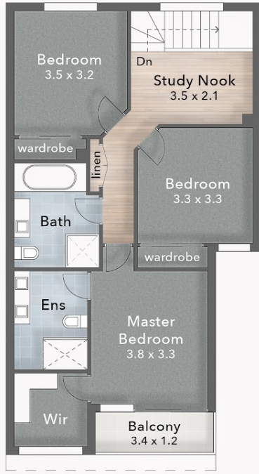
// FLOOR PLAN First Floor - Townhouse 4 2.5m Ceiling