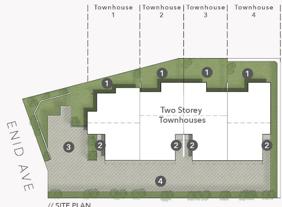
// SITE PLAN