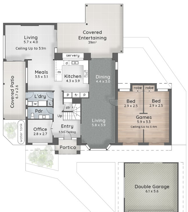
:: FLOOR PLAN Ground Floor