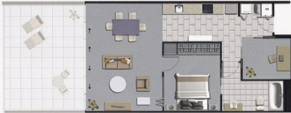
Note - Typical floor plan shown, balcony shapes & sizes vary.

No of Bedrooms - 1 + Study No of Bathrooms - 1 No of Car Parks - 1