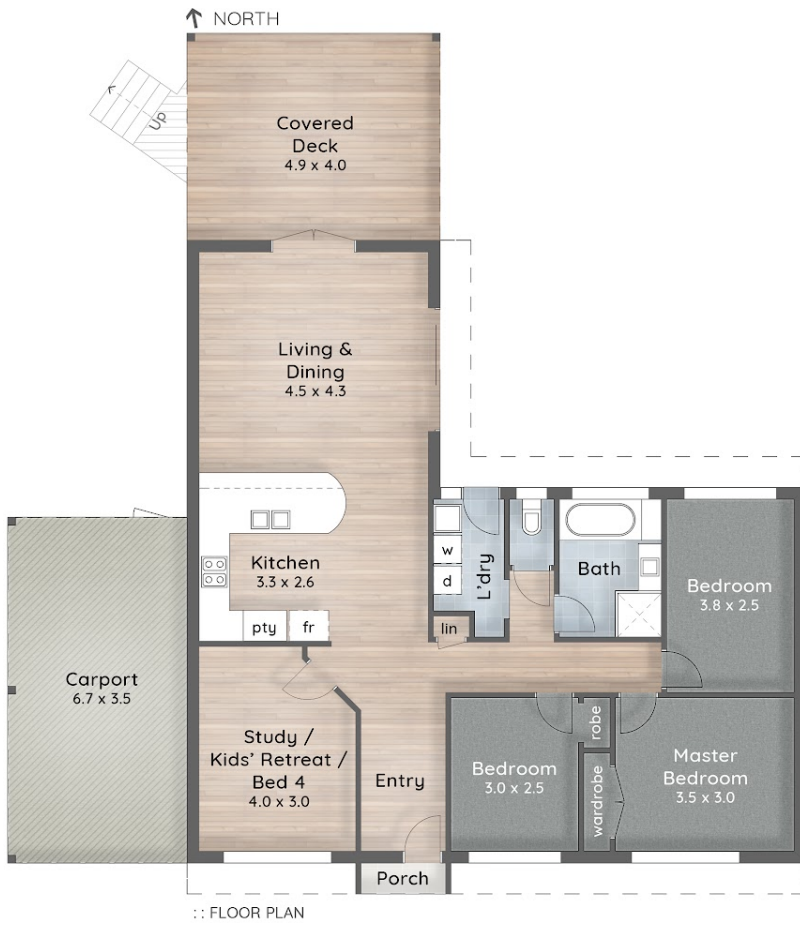
:: FLOOR PLAN