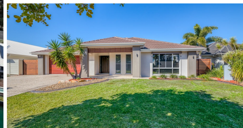
Keyline is for visual purposes only.