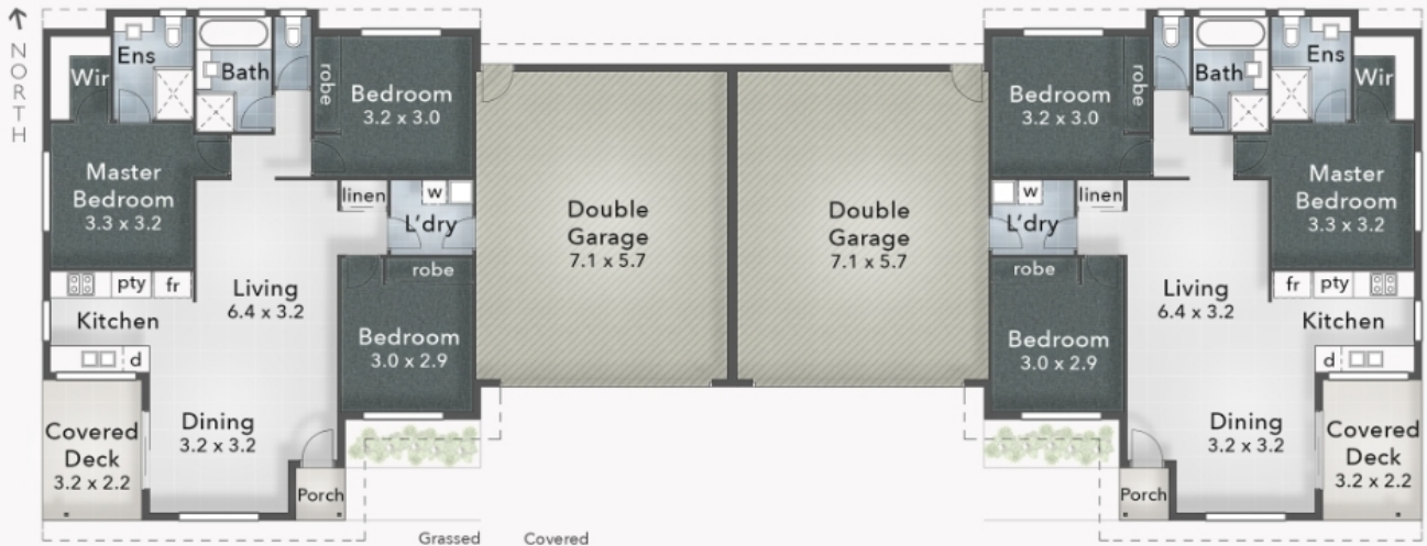
// FLOOR PLAN