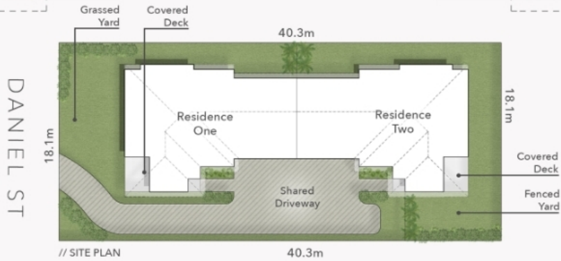
// SITE PLAN

4 Daniel Street LOWOOD Block Size 729m 2