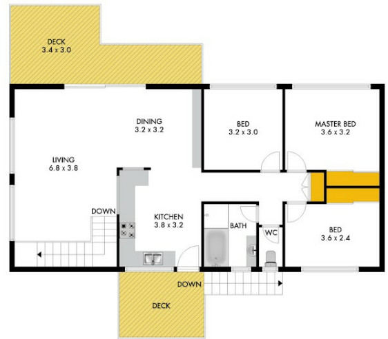
LIVING FLOOR APPROX. FLOOR PLAN AREA IS 130M 2