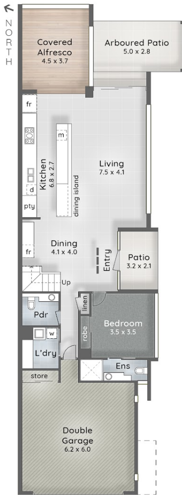
:: FLOOR PLAN Ground Floor Ceilings up to 3.0m