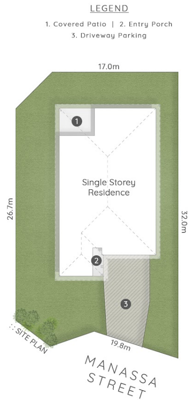
:: SITE PLAN