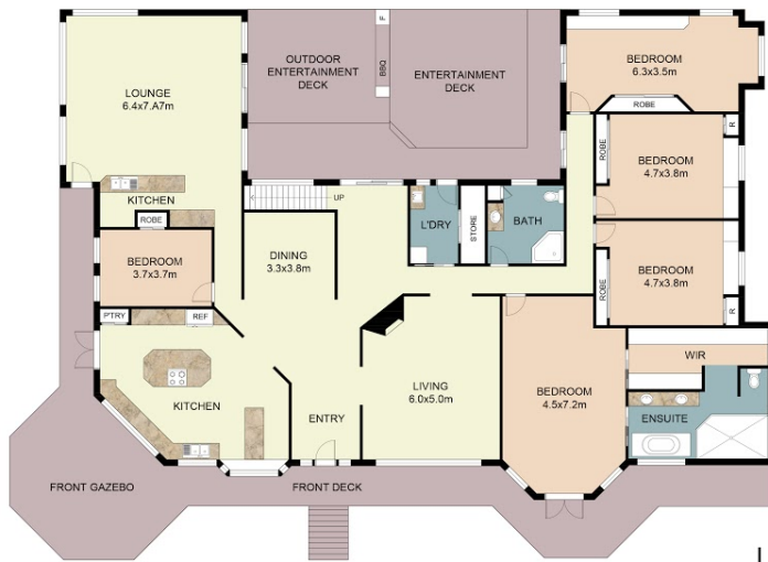
MAIN LEVEL PLAN