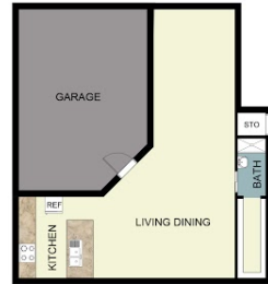
LOWER LEVEL PLAN