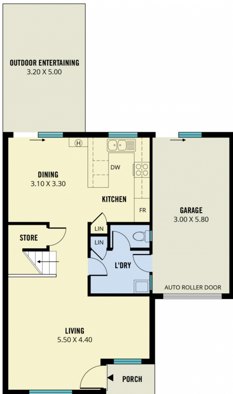
LOWER LEVEL PLAN