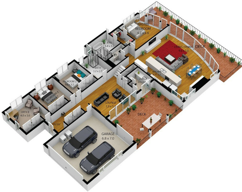
3 French Island Close, Corinella VIC, Australia, 3984 TOTAL APPROX. FLOOR AREA 265 SQ.M

Whilst every attempt has been made to ensure the accuracy of the floor plan contained here, measurements of doors, windows, rooms and any other items are approximate and no responsibility is taken for any error, omission, or misstatement. This plan is for illustrative purposes only and should be used as such by any prospective purchaser.