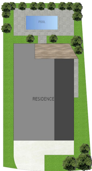
RANKIN STREET SITE PLAN