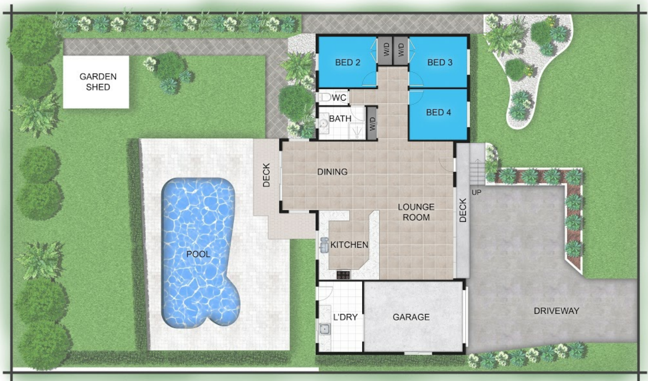
LOWER LEVEL FLOOR PLAN ON SITE

Disclaimer: Please note this floor plan is for marketing purposes and is to be used as a guide only. All dimensions are estimates only and may not be exact measurements.