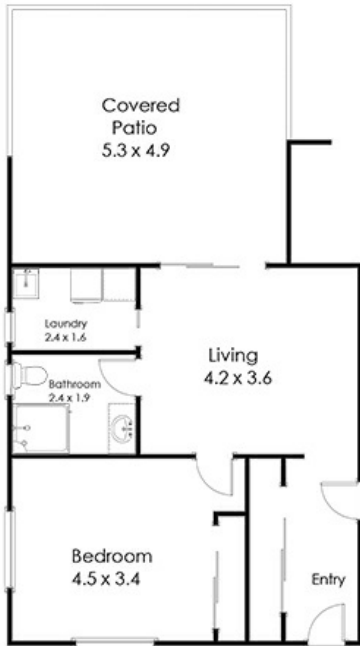
Total Living Area 14 sq mtr