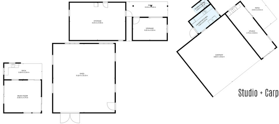
Studio + Carport