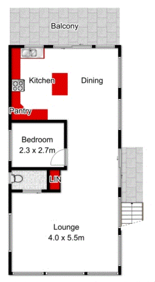
35 Bass Horizon Promenade, Coronet Bay

Fixtures & Fittings are for display purposes only, not to scale Produced by Black & White Real Estate Marketing