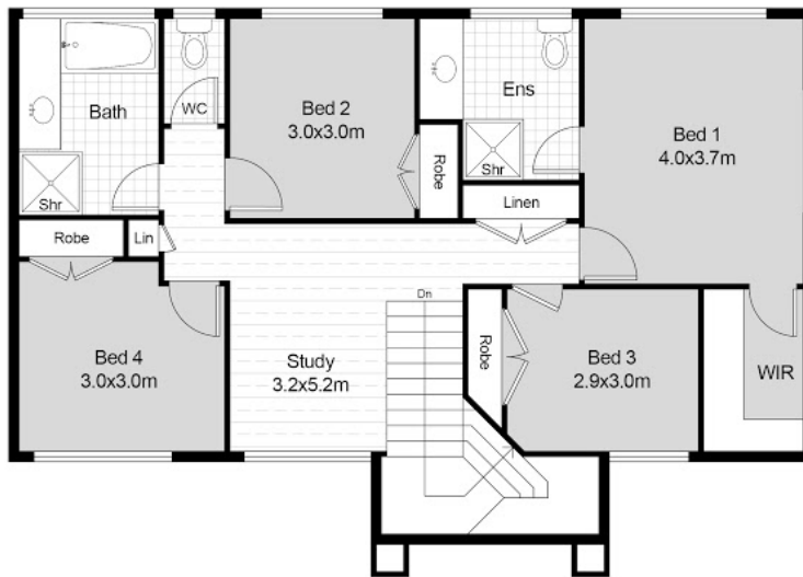
UPSTAIRS FLOOR PLAN