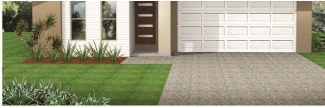
Front Façade is indicative only