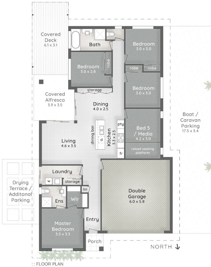
:: FLOOR PLAN