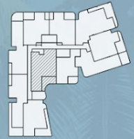
// FLOOR PLAN

The overall presentation style, layout, imagery, fonts, background colours and terminology are subject to strict copyright of Pure Design Concepts. No ownership is taken for building design. All measurements are approximate & individuals should rely on their own information.