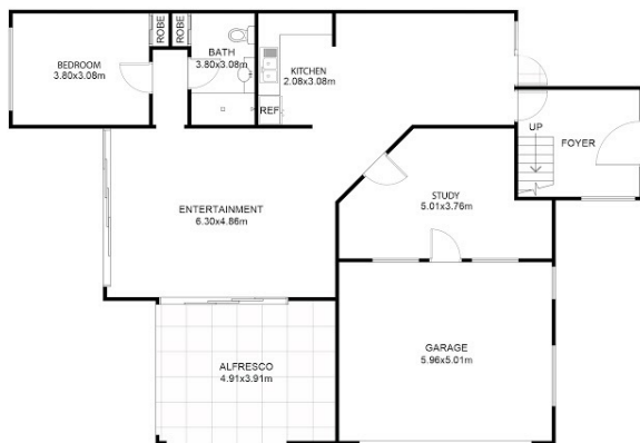
GROUND FLOOR PLAN 203m 2