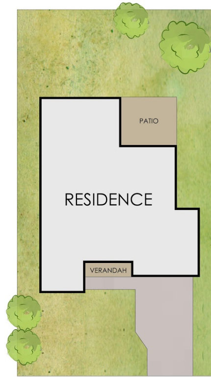
PERCY STREET SITE PLAN