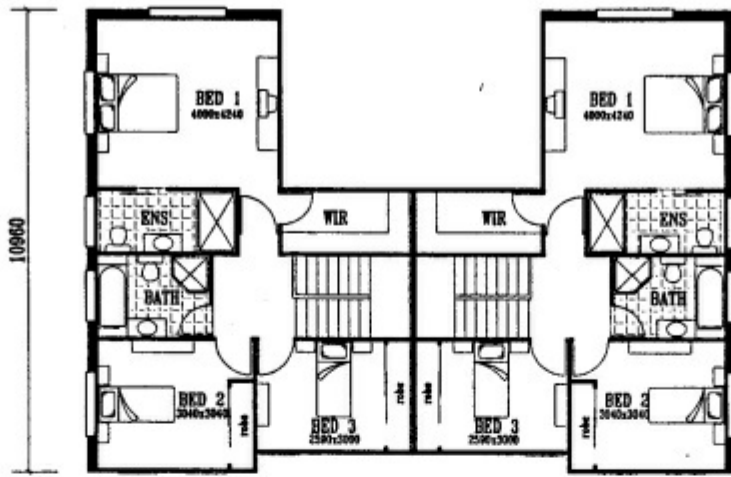
UPPER FLOOR LAYOUT