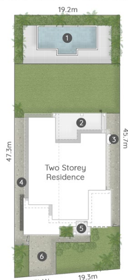
:: SITE PLAN THE BOULEVARD