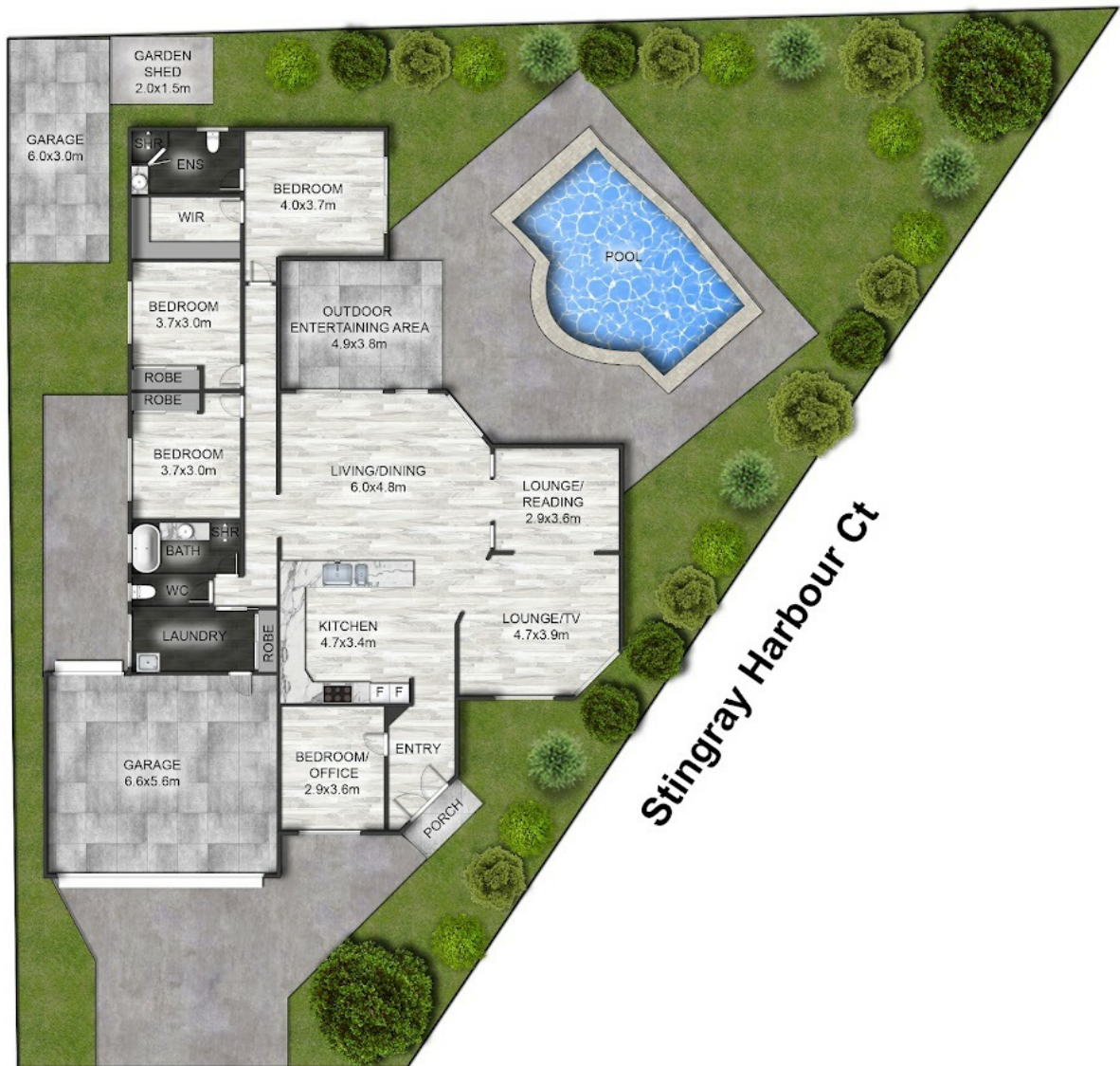
FLOOR PLAN ON SITE

Disclaimer: Please note this floor plan is for marketing purposes and is to be used as a guide only. All dimensions are estimates only and may not be exact measurements.