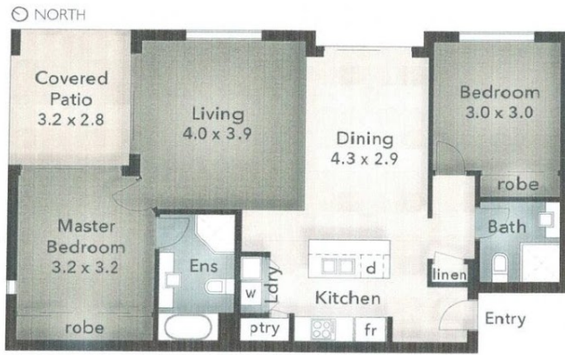
// FLOOR PLAN - Unit 3