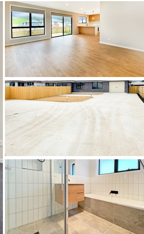
Similar Home by same builders