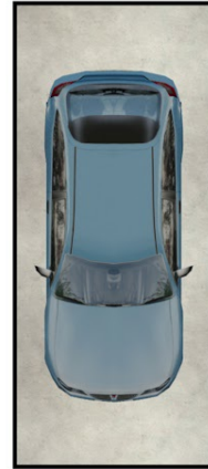
CARSPACE (Not shown in position)