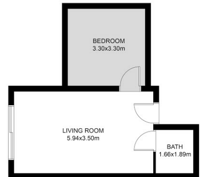
BOAT SHED FLOOR PLAN (NOT IN POSITION)

This floor plan including furniture, fixture measurements and dimensions are approximate and for illustrative purposes only. Boxbrownie.com gives no guarantee, warranty or representation as to the accuracy and layout. All enquiries must be directed to the agent, vendor or party representing this floor plan.