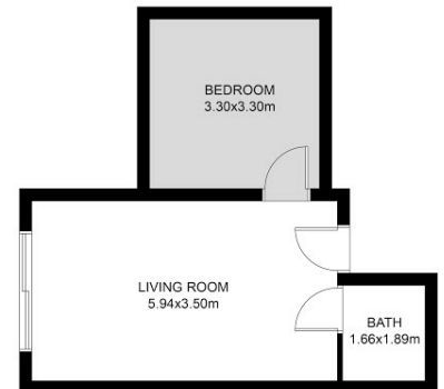
BOAT SHED FLOOR PLAN (NOT IN POSITION)

This floor plan including furniture, fixture measurements and dimensions are approximate and for illustrative purposes only. Boxbrownie.com gives no guarantee, warranty or representation as to the accuracy and layout. All enquiries must be directed to the agent, vendor or party representing this floor plan.