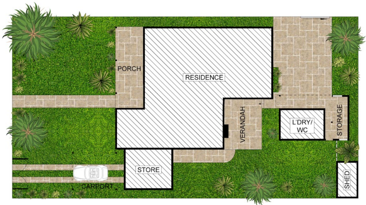
SITE PLAN ( NOT TO SCALE )