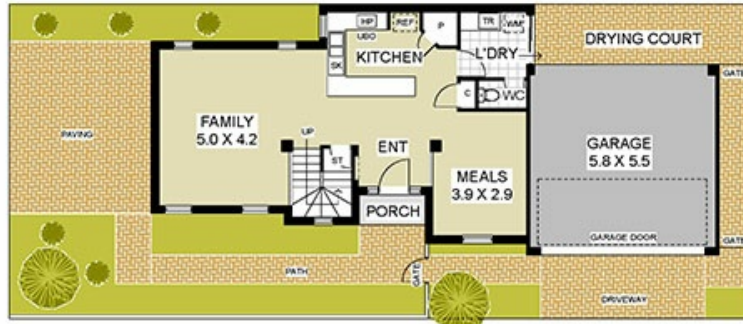
GROUND FLOOR AND SITE PLAN