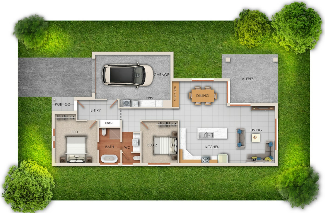
12 Keegan St Project Floor Plan

Disclaimer: Please note this floor plan is for marketing purposes and is to be used as a guide only. All dimensions are estimates only and may not be exact measurements.