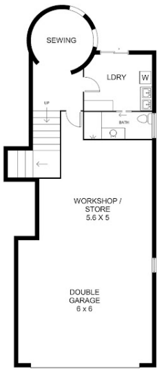
UNDERCROFT FLOOR LEVEL