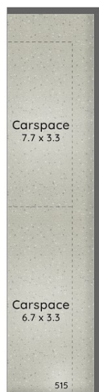
:: FLOOR PLAN Basement P4